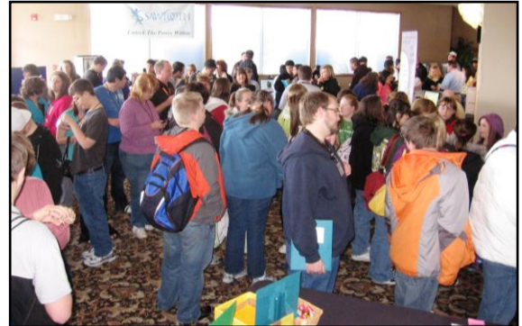
The group gathers waiting to be seated for lunch

It continues to take a lot of financial, organizational, and physical help to put on the Tools for Life conference. The cost of the Tools for Life 2011 conference was over $64,000.00. The Idaho Assistive Technology Project staff provides the year-to-year planning, fundraising, and organization for the Tools