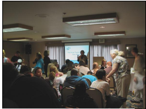
One of many sessions focusing on the needs of transitioning students