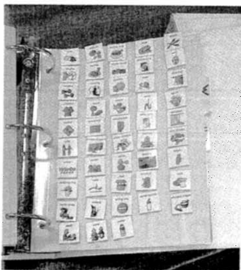
Example of visual dictionary created for class for words of the day.