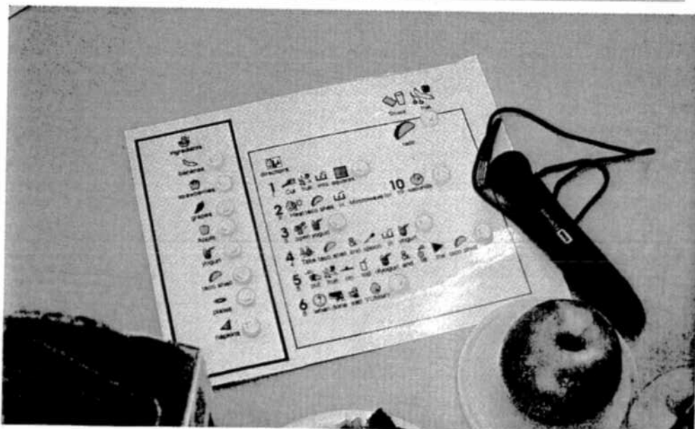
A talking pen is used for the students to share the directions with their peers.